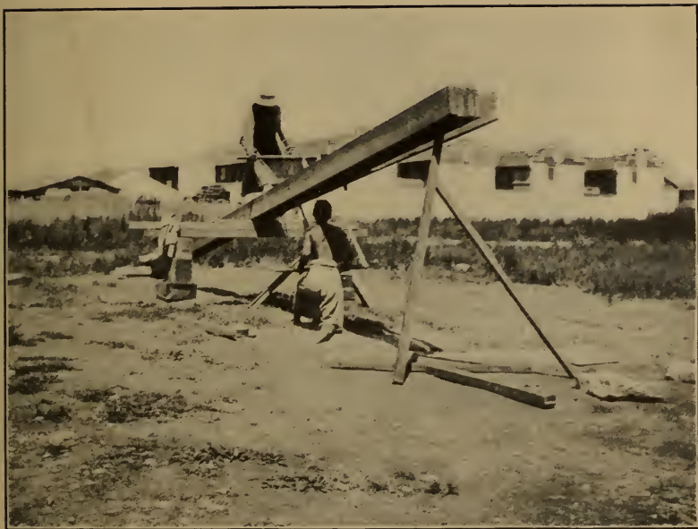
SAWYERS PREPARING LUMBER.